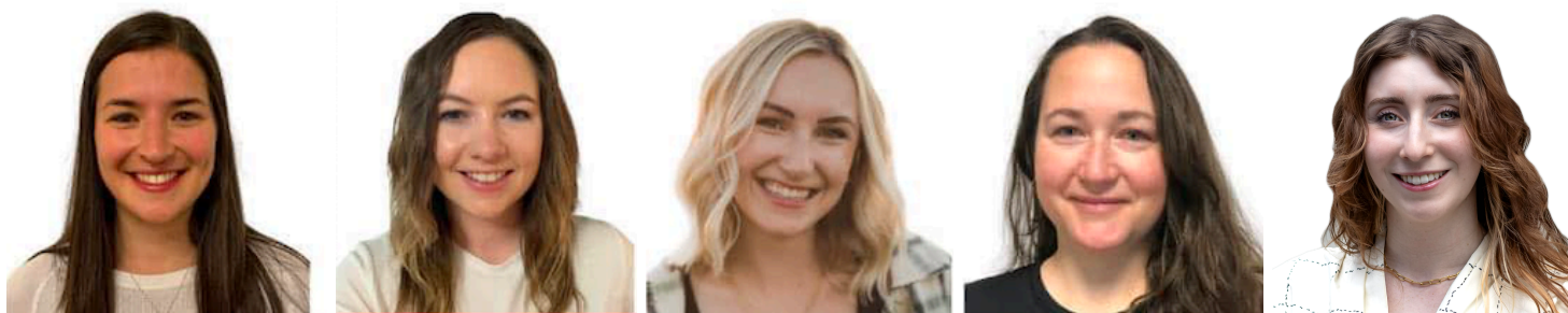
2026 Canada Women's Deaf Curling Team