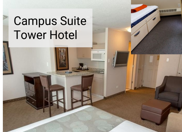
Campus Suite Tower Hotel

Campus Suite Tower Hotel Reg. $186 per night