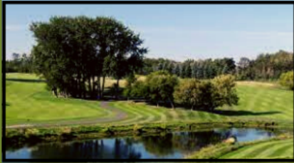
Part of the course