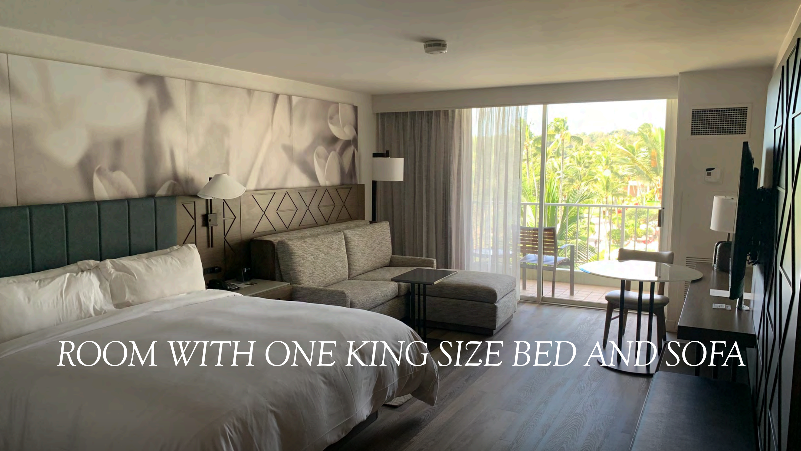
ROOM WITH ONE KING SIZE BED AND SOFA