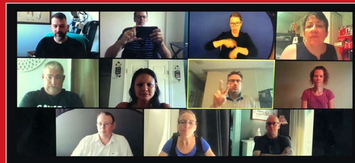
The CDSA Board of Directors and staff as well as LSQ/ASL interpreters held their meetings on Zoom.

The Board of Directors also held two meetings via video conference on November 17, 2019 and December 8, 2019.