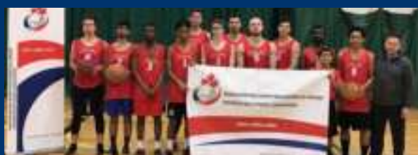
Team Canada Basketball Training Camp Edmonton, AB