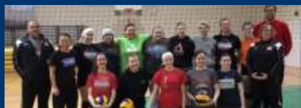
Women's Volleyball Selection Camp Edmonton, AB