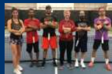
East Regional Tennis Clinic Ottawa, ON