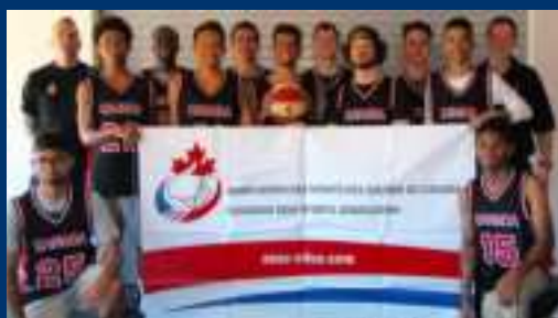
Team Canada Men's Basketball U21