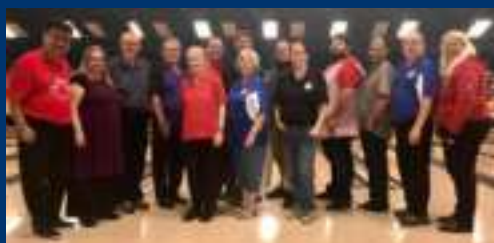
West Regional Bowling Clinic Burnaby, BC

Improvements to Participant's Sports Techniques LTAD Potential Athletes' Identification and Recruitment by CDSA's National Coach