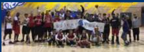
Basketball Training Camp Toronto, ON