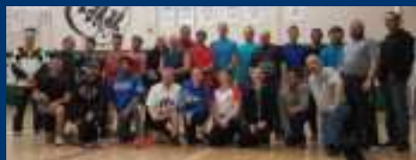
National Badminton Clinic Winnipeg, MB