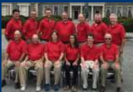
Team Canada Golf (2 women, 5 men, and 4 seniors)

2 wins and 5 losses 7th position (10 teams)