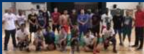
West Regional Basketball Clinic Edmonton, AB