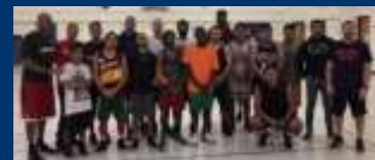
East Regional Basketball Clinic Toronto, ON