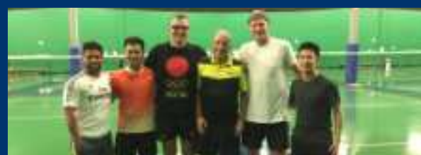
Team Canada Badminton Training Camp Calgary, AB