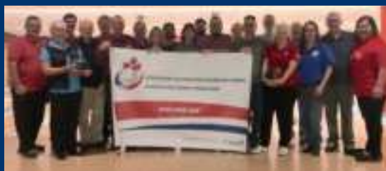
East Regional Bowling Clinic Montreal, QC