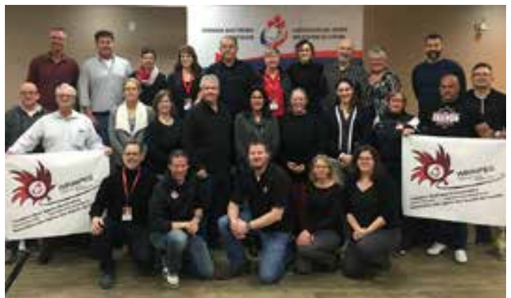
Participants at the 1st CDSA Coach Summit in Winnipeg, Manitoba in February 2018.