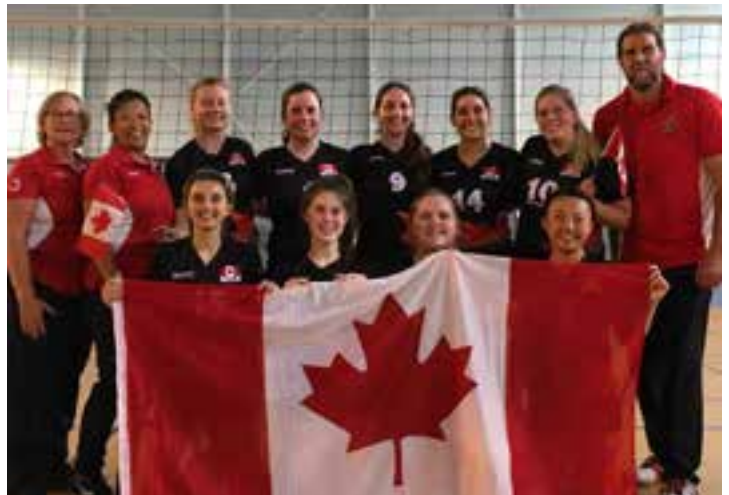
The Canadian Women's Volleyball Development Team in preparation for an European tournament.

The Canadian Deaf Sports Association (CDSA) is a non-profit organization dedicated to the development of high performance Deaf and hard of hearing athletes. Through direct financial support CDSA helps athletes participate in international sport events sanctioned by the International Committee of Sports for the Deaf (ICSD), and the Pan American Sports Committee for the Deaf.