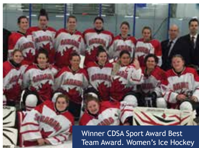
Winner CDSA Sport Award Best Team Award. Women's Ice Hockey