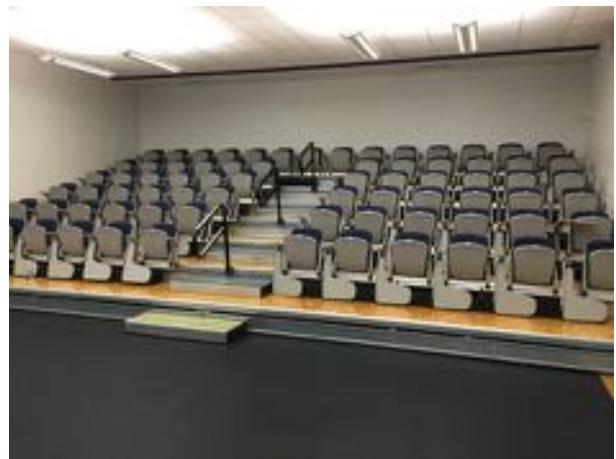
Training Venue: Kendall Sports Gym (1 Court)