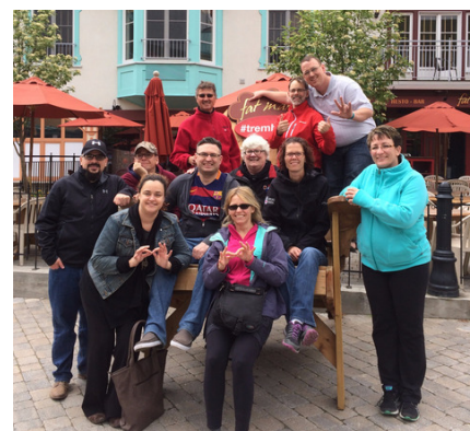
Members of the Board and Athletes Representatives met in Mont-Tremblant.