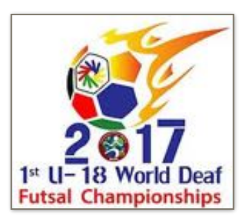
Official Logo of U18 World Deaf Futsal Championships

Bangkok, Thailand - From the 24 November to 3 December, the 1st U-18 World Deaf Futsal Championships was held under the aegis of the International Committee of Sports for the Deaf (ICSD) and the Deaf International Football Association (DIFA).