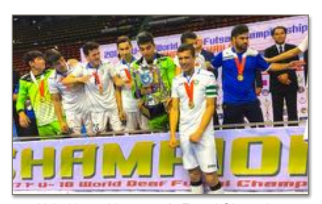
Uzbekistan U-18 men's Futsal Champion